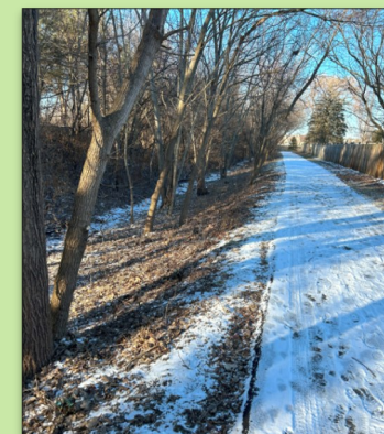
Invasive underbrush was removed from the west side of the Woods creek Park path to Alexandra Blvd.