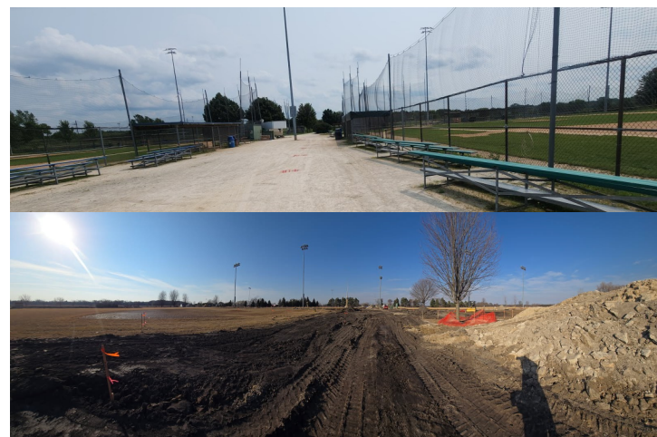
Grading improvements at Mickey Sund Baseball Fields

Additionally, the Boncosky fields will have some minimal site re-grading to improve drainage.