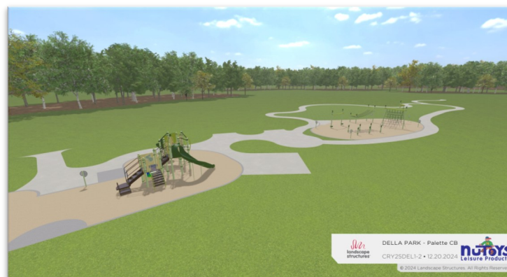
Rendering of Della Street Park improvements to be made this summer.

The Park District held a community meeting last summer where residents viewed and shared ideas and preferences for play equipment and park amenities at the Della Street park site. The goal is to break ground in May. The project entails replacing the playground equipment and adding a challenge course. Additional amenities include a shade shelter and picnic tables, a bench, interpretive signage, baggo game, and circular stone seating area. A perimeter walking path will enable visitors to enjoy nature through an area of habitat restoration within the park. The District received an IDNR OSLAD Grant for $329,000 to partially fund this park project.