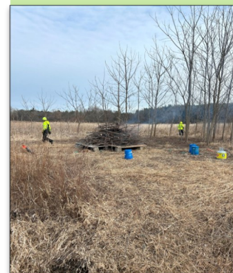
Walnuts were removed in the fen at Sterne's Woods. This was to allow more conservative species to establish.

The Parks Services employees have been educated on land management techniques and plant identification in order to complete low disturbance ecological restoration projects.