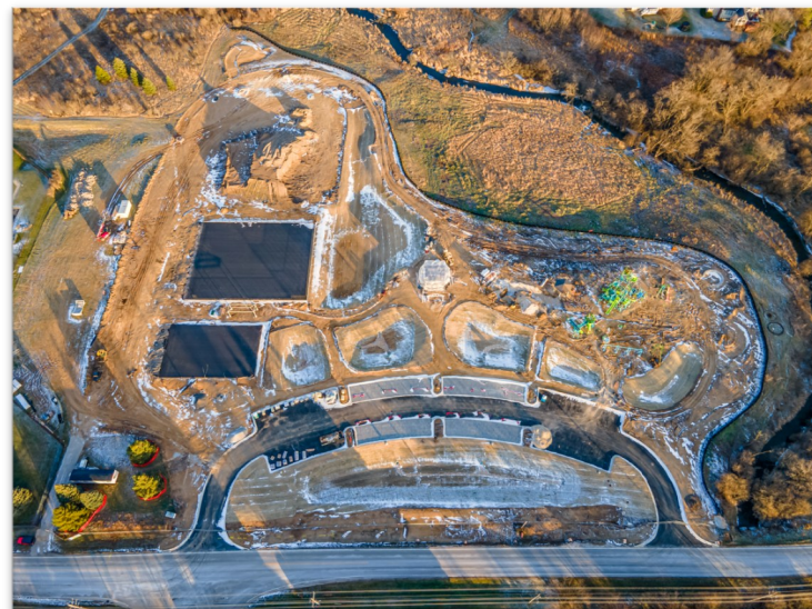
Aerial View of the new Lakewood Meadows Park under construction

The District received an IDNR OSLAD Grant for $600,000 used to partially fund this park project and an additional $162,000 from Gametime/IPRA Playcore grant for playground components.