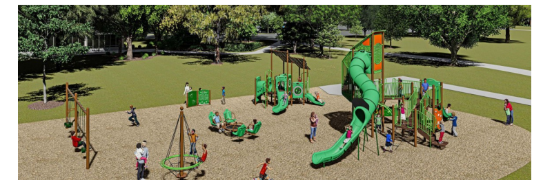
Brighton Oaks Playground Concept

Playground surfacing and playground structure project updates can be found on our website at crystallakeparks.org/project-updates .