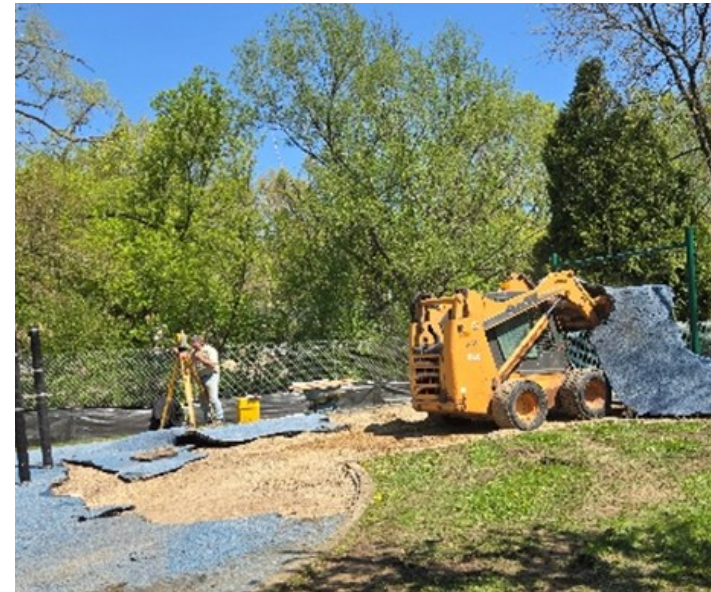
Removal of the old rubber surfacing and play equipment