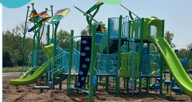
Playground featuring zipline!

THE PARK IS CLOSED TO THE PUBLIC UNTIL CONSTRUCTION IS COMPLETE