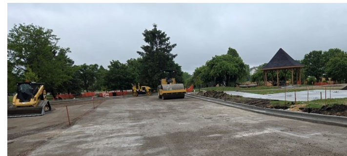
Concrete curbs frame out the sport courts and parking lot, and a new concrete pad was poured for the new shelter. The final phase of the project will include pathway refurbishment.

Along with rehabilitating the courts and parking lot, a new shade shelter will be installed at the park. The picnic table and bench by the playground has new concrete to provide ADA compliant access to the playground. The gazebo will be refreshed and "rock" seating installed, offering different areas to gather.