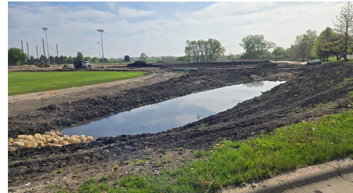
Stormwater retention area south of Field 3 will help with drainage.

A complete overhaul of the Mickey Sund baseball fields has been underway. Drainage, field grading, fencing, dug outs and porta-potty upgrades are just a few of the many improvements being made. Stormwater is a large component of the rehabilitation of these fields which you can see with the expanded retention basins south of Fields 3 and 4.