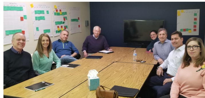
Lake Advisory Committee Meeting, Jan 2020

If you have a concern or topic regarding Crystal Lake, you can forward it to the LAC at lakeadvisorycommittee@gmail.com .